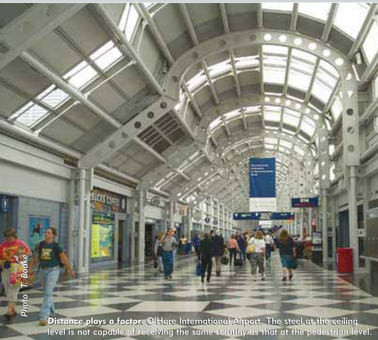
Distance plays a factor. O'Hare International Airport. The steel at the ceiling level is not capable of receiving the same scrutiny as that at the pedestrian level.

construction Specifications. A set of Characteristics was then developed that was associated with each Category. Higher-level Categories include all of the Characteristics of the preceding Categories, plus a more stringent set of additional requirements.