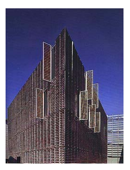
Finnish Embassy in Berlin Louvers for Solar control

as a buffer from harsh winter wind. During the winter months these louvers can be opened completely or partially for desired solar and light penetration. In the summer, they are angled to block direct solar gain, but diffuse light into the house. With the right angle, the screens can also help in inducing wind into the house. This concept of a second skin is adapted the design of the Finnish Embassy in Berlin by the Finnish design group, Viiva Arkkitehtuuri. The giant louvered grilles of the Embassy are constructed from larch strips; these louvers are adjusted throughout the day to control interior lighting conditions<sup>7</sup>.