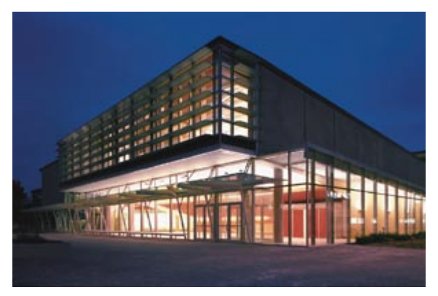
York Computer Science Building Protected walkway that promotes campus walk

to promote campus walk<sup>2</sup>. Not only is this idea effective in enhancing a pedestrian environment, by pulling traffic between buildings at ground level (as oppose to underground passages), it really animates the campus as a whole, especially with its large glass facades.