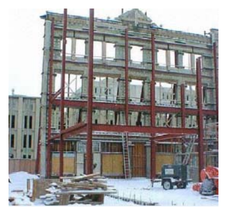
Red River College Preserving the existing facade

Materials are selected with the concept of resource conservation in mind. Most of the house is constructed of old material, either reuse or salvaged from another site. Reclaiming old material benefits both in resource conservation and