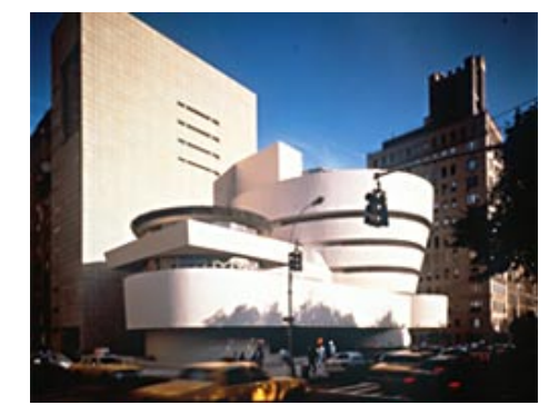
6-Guggenheim Museum, showing Gwathmey Seigel Addition behind

The Guggenheim embodies transformation not only in its dualistic nature of being both art and architecture but also in the experience that it offers. The transformative experience in the Guggenheim has been exhaustively argued to exist on a spiritual level within the spiraling rotunda. Addressing the 1993 addition to the museum by Gwathmey Seigel Architects, J. Quinan writes: "it is clear that the recent alterations by Gwathmey Seigel have seriously