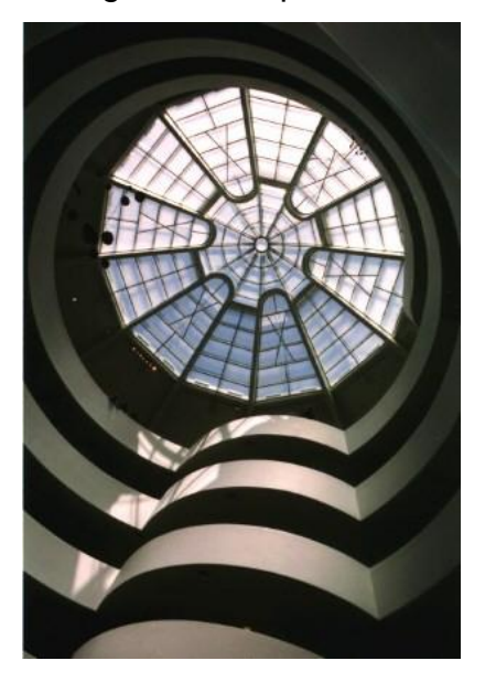
7-Guggenheim Museum, View upwards towards dome of spiral rotunda

further by stating: "In an age and a country ambivalent about religion, Frank Lloyd Wright's Guggenheim Museum is one of the rare modern buildings that affords an unequivocal spiritual experience."<sup>xvii</sup> Philip Johnson goes so far as to state that the Guggenheim is the only building in America that offers a comparable experience to that of Chartres.<sup>xviii</sup> The emphasis on the form and emotive quality of the interior of Wright's gallery was very important as a conducive environment to house the contemporary art of abstract expressionism during its development.