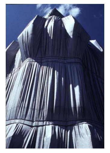
9- Wrapped Reichstag, Berlin

David Galloway described the lighting of the Reichstag project; "...as a purely visual phenomenon the Wrapped Reichstag was astonishingly protean. The aluminized surface of the building's polypropylene sheath responded to every nuance of the light, reflecting a shimmering blue when the sky was clear, a leaden gray when it clouded over, flaming orange at sunset, yellow-gold when spotlights were turned on it at night."<sup>xxvii</sup>