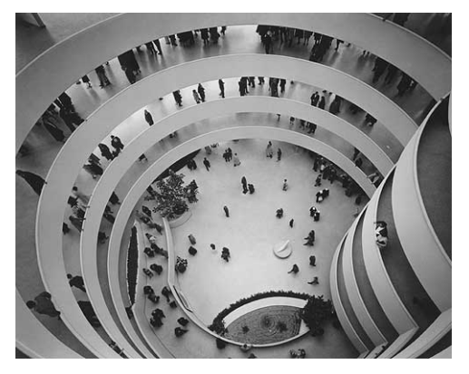
11- Guggenheim Museum, New York

The Guggenheim has been faced with the challenging task of marrying the contrasting form of a curvilinear architectural surface upon which to display rectilinear works of art. "While the iconic value of the exterior was often taken for granted, the interior surface was attacked for not fulfilling its function successfully. The icon and the institution were maintained as separate categories, often through a separation of 'architecture' and exhibition surface."xxx Another aspect of contrast in Wright's work occurs between the external and internal reading of the spiraling volume. From the outside, the rotunda clearly expands outwardly as it ascends while on the inside the spiraling ramp increases in width as it ascends, diminishing the central space towards the top and thus creating a perspectival effect of increasing the height of the structure.<sup>xxxi</sup> Vincent Scully describes the contrasting experience of scale as one moves through the building: "Upon entrance, under the skeletally obtrusive and therefore volumenegating dome, the building seems small. It does not exalt man standing fixed and upright within it. The meaning is in the journey, since from above, upon leaving the elevator, the visitor finds the space dizzying and vast, while the great downward coil of the ramp insistently invites him to movement."xxxii