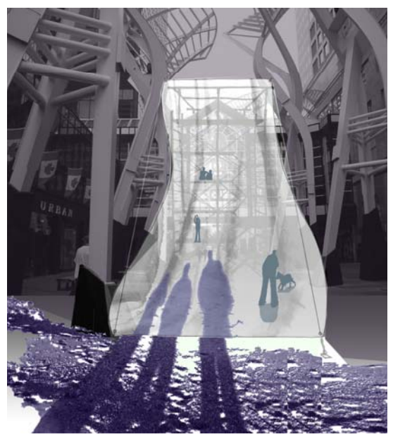
1- View of Urban Canvas, Elusive Projections

The theme of the 2005 Peepshow International Pavilion Design competition is "Trans". The chosen pavilion will be reconstructed annually to exhibit contemporary visual art for the Artcity festival in Calgary, Alberta. Entrants were challenged to answer the question of how TRANSarchitecture could be defined as an art pavilion. The typology of an art pavilion may perhaps be most closely linked with that of an art gallery or museum of art. The typological history of a formal art gallery, a building designed with the sole intention to house and exhibit art, does not date back beyond the Louvre<sup>i</sup> (1793). Before that, art was displayed in caves, temples, palaces, and cathedrals. A pavilion, a term which suggests impermanence, finds itself at odds with the formal definition of an art