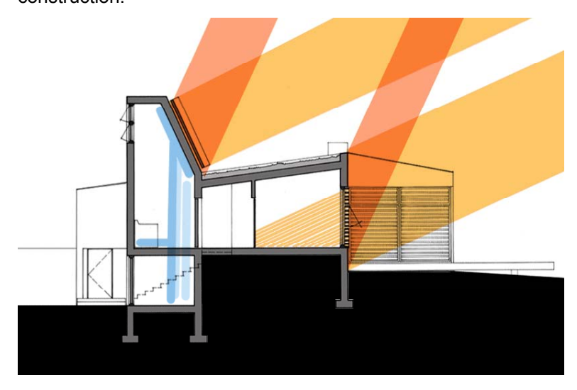
Figure 9 - Eco House: Guelph - cross section highlighting major eco building systems

and in combination with operable "shuddered" windows regulate the temperature during the summer months. Composting toilets and cisterns collecting grey water reduce the home's dependency on the city's infrastructures. Modern technology references period standards of construction.