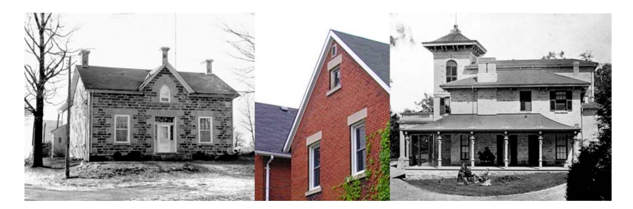
Figure 3 – Inspirations (from left to right) - Arkell House: an Ontario House, Typical Foursquare along Edinburgh Road in Guelph and Guthrie House: an Italianate manor.