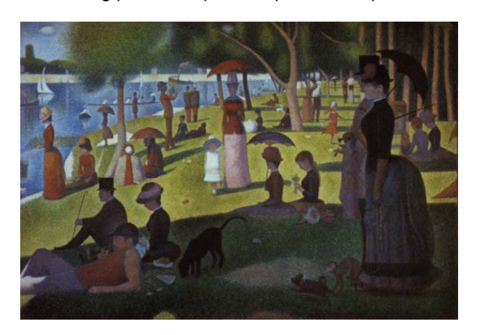
Figure 6 – A Sunday Afternoon on the Island of La Grande Jatte by Georges Seurat

The Victorian ideal of the natural and the unspoiled is a romantic principle that is embodied in the yards of its homes and in the design of its public parks. It celebrates the wild and the overgrown but in reality denudes the landscape, shaping the environment into gently meandering paths and picturesque backdrops for the events of public/private life. The Eco-house