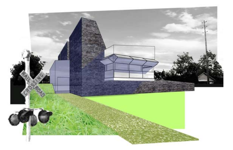
Figure 5 – Eco-House Guelph an exterior perspective illustrating siting, massing and asymmetric composition

Arch 484; Design Competitions Elective Matthew Muller – 99027911