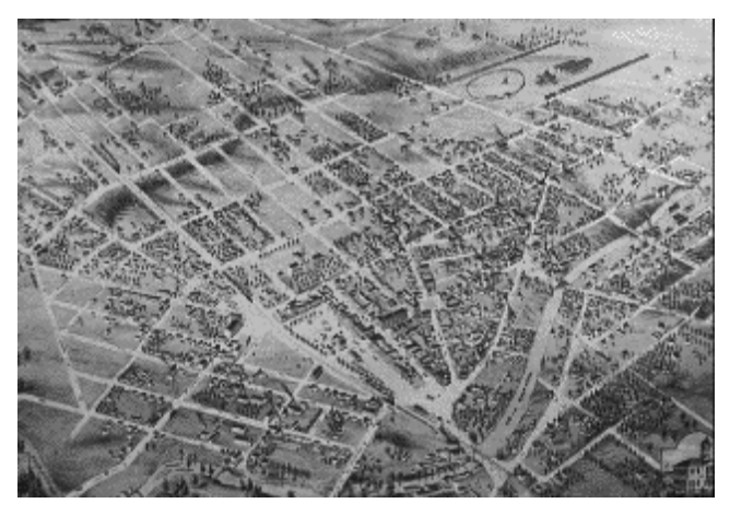
Figure 1 – A bird's eye view of Guelph in 1872: post rail-line insertion.

In order to fulfill its destiny Guelph sacrifices its physical, civic and symbolic heart to stimulate and promote growth and development. The unified experience offered by Guelph's baroque inspired plan of radiating streets; it's vistas, squares and interconnected urban artifacts (churches, markets and mills), is undermined by the introduction of the Grand Trunk Railway in 1856. Connecting Toronto to Guelph, the rail-line slices through Priory Place; the foundation of the town, bisects the main public square and marketplace, and appropriates a Victorian lined boulevard thus creating a divide. This divisive element brought expansion and industry to the