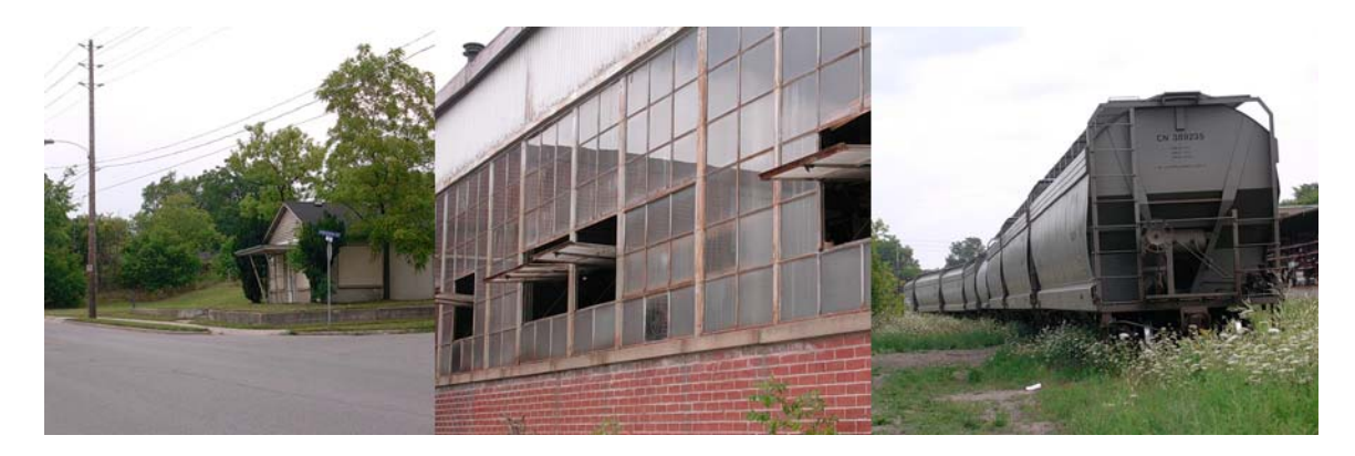
Figure 2 – The "Divide" (from left to right) - The Site at the corner of Preston Street and Edinburgh Road, Typical Factory Shed, Abandoned tracks and cars.