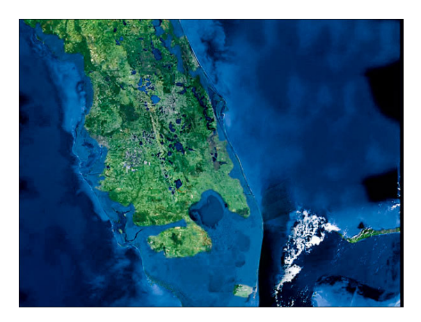
In Al Gore's film An Inconvenient Truth, images of costal regions (this one showing Florida) project a global endemic in flooding due to glacier runoff, tropical storms, and other natural disasters. Due to such significant flooding circumstances, my design takes into consideration flooding by incorporating a boat into a temporary shelter condition.