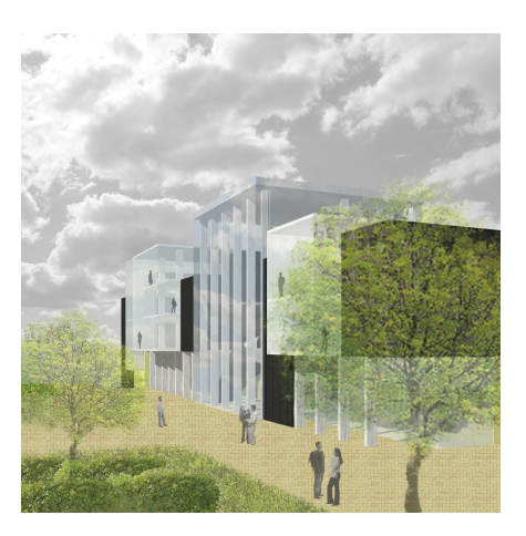
Figure 6 – Proposed exterior; glass volumes indicate public gathering spaces

building," (Awards) conceived of the new library as a "wrapper," enveloping the existing library and allowing for old and new to co-exist in an exciting yet functional way. (Figure 5) This idea of "wrapping" the building artifact, and of a direct juxtaposition of old and new, was especially influential to our design. Our parti began with a series of translucent bands wrapping the existing building, working carefully to alternately conceal and reveal the existing