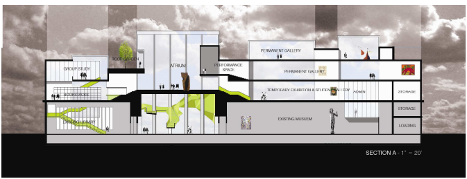
Figure 8 – Proposed section shows overlapping of volumes, juxtaposition of old and new

integrated. Though this dramatic move would require minor alteration and demolition of the original building shell, the powerful new connections it would create can