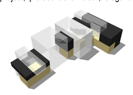
Figure 3 – Massing model shows translucent bands wrapping original building

preservation places priority on the protection of a building's original intent, and focuses on the potential to "experience [artifacts] in new and meaningful ways," (ACSA 03) rather than on the building's historically perfect maintenance and restoration. To guide us in our understanding of this concept, we looked to Alar Kongats' 2006 addition to the Hespeler Public Library. ( Figure 3 ) This project, praised as a "clear, elegant solution to the problem of expanding an existing historic