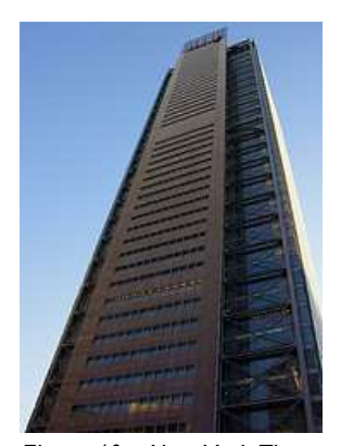
Figure 10 – New York Times Tower, NYC (Renzo Piano: 2006)

each other as well as the exhibits from an unprecedented number of perspectives" (Newhouse 221) we had the additional challenge of wanting to create varying and new perspectives of the building itself.