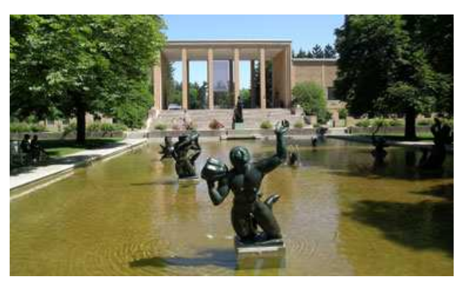
Figure 1 - Cranbrook Academy Museum & Library, Michigan

In the case of this year's ACSA historical preservation competition, the problem statement is doubly relevant. While, as the problem statement asserts, all design is influenced by the past ideas, this competition required an addition to Eliel Saarinen's Cranbrook Academy Museum and Library that "would be unimaginable without the structures." (ACSA 01) In this way, the consideration of past precedents and typologies did not only affect our work on a