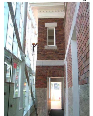
Figure 5 – Hespeler Public Library, Cambridge ON (Alar Kongats:2006)

structure. (Figure 4) These bands evolved into glass volumes that housed public gathering and major circulation spaces. The goal was for these volumes to directly interact with the existing structure. highlighting the significance of the exposed original building on the interior while allowing glimpses Saarinen's building from the exterior. (Figure 6) In this way, visitors were to be