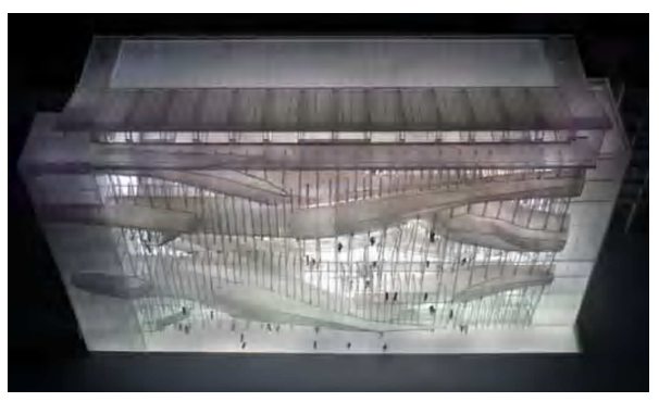
Figure 11 – Fashion Institute of Technology, NYC (Shop Architects PC : unbuilt)