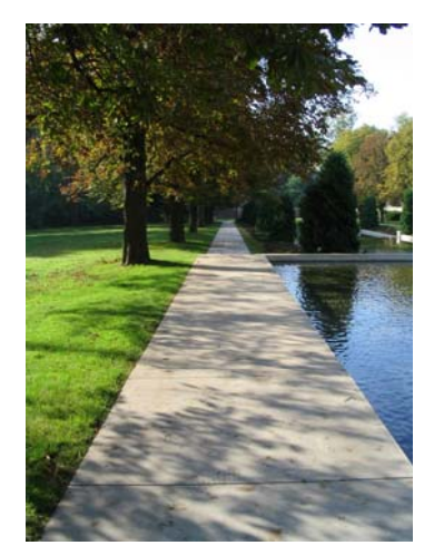
View of Cranbrook landscaping.

The preservation of Cranbrook began by realizing its significant aspects and the quintessential elements that describe and tell the story of Cranbrook. Our ideal was to create using its past as precedence to build a new but essential addition. As the experience of the visitor was a primary focus during its original design conception, we not only aimed to preserve that experience, but also sought to enhance it. The library and museum had become true historical artifacts culturally significant and essential to the Cranbrook Academy. By building onto the landscape an addition to meet the growing needs of the institution, would be to alter the human experience as other objects within the landscape would cause an imbalance between garden and building, as well as pulling focus away from the existing buildings and breaking the original axes. Instead, we concluded that by burrowing underground to create a new world would offer a new way to experience Cranbrook, provide the space needed for its growing collections, whilst preserving the initial experience of Cranbrook through the visitor as envisioned by Saarinen.