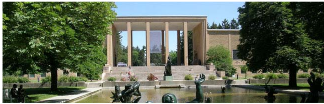
South elevation of Cranbrook Library and Museum. Middle: view of open propylaea.<sup>2</sup>

The original library and museum consists of three parts in his design; an enclosed library, an enclosed museum, and an open propylaea interrelating the programs. The building in context has two main axes: the primary axes stretches from the Orpheus Fountain entrance through to the library – museum propylaea and down towards the Triton Pools, the secondary axes runs from the library through the colonnade to the museum.<sup>2</sup> The primary axes through the propylaea suggests a focus on the idea of the experience of the visitor as one passes through the architectural artifacts and through the formal gardens. The experience of the visitor is not solely defined by the building or the matter contained within it, but the landscape plays a vital role in creating a grandeur entrance as well as to define the complex as an architectural whole. The enclosed spaces of the library and museum house literary and historical artifacts while being an artifact itself contained and exhibited by the landscape. Through the creation of the axes, Saarinen gives the opportunity to experience objects in a meaningful way.