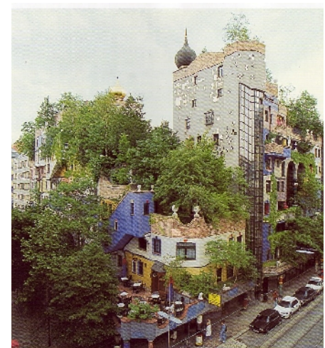
Illustration 1: Hundertwasser Haus, Vienna

The project attempts to provide an environment of primarily lowincome housing that is safe and vibrant at the same time, avoiding common antisocial mistakes from numerous housing projects. It can be observed that all successful low-income neighbourhoods tend to compensate for its poverty with a form of lively disorder. The obvious strategy in this case is mixed-use planning, such that the potential for crime due to the concentration of a certain demographic will be negated by activity on the ground floor retail and plazas, which brings about a more diverse pedestrian traffic through the area. The design of the neighbourhood encourages social interaction, placing cafe-type plazas where human traffic will naturally occur, and the conversion of the Ainslie bus terminal into something of an open market place. Details such as faux balconies open up an otherwise small apartment