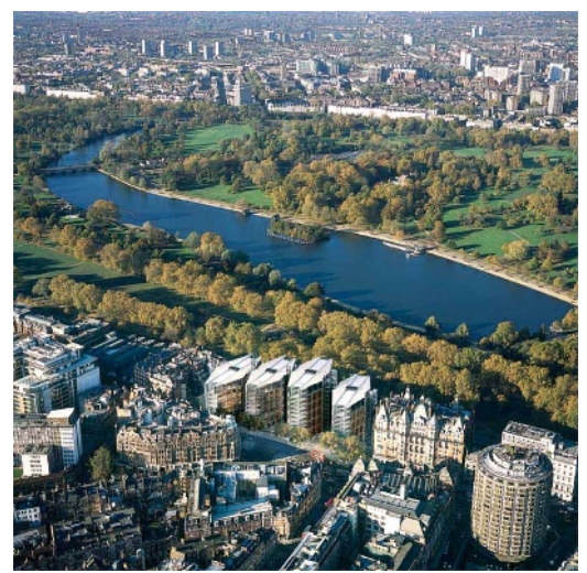
Illustration 2: Hyde park, London

The current boundary between the Galt core area and the southern suburbs consist of several blocks of rotting structures and decaying brownfield. The end goal of this project is to replace the eyesore with a greener and more defined edge to the downtown core. It focuses much of the density and retail to the northern blocks surrounding the bus station, such that, combined with the adjacent core area blocks, it will remain a lively place during all hours of the day. The southernmost block offers parkland and partially-subterranean amenity space, which is subsidized by the construction of higher-end apartments above. The resulting environment echoes many European cityscapes where the forested park acts as a serene buffer and boundary between the city and countryside. Offering a more stately entrance into Galt from the south via Ainslie Street, the development aims to restore a sense of destination to the town center, as well as a healthier identity for Cambridge at large.