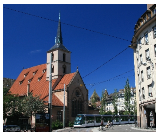
Illustration 3: A transit-oriented town core in Strasbourg, France