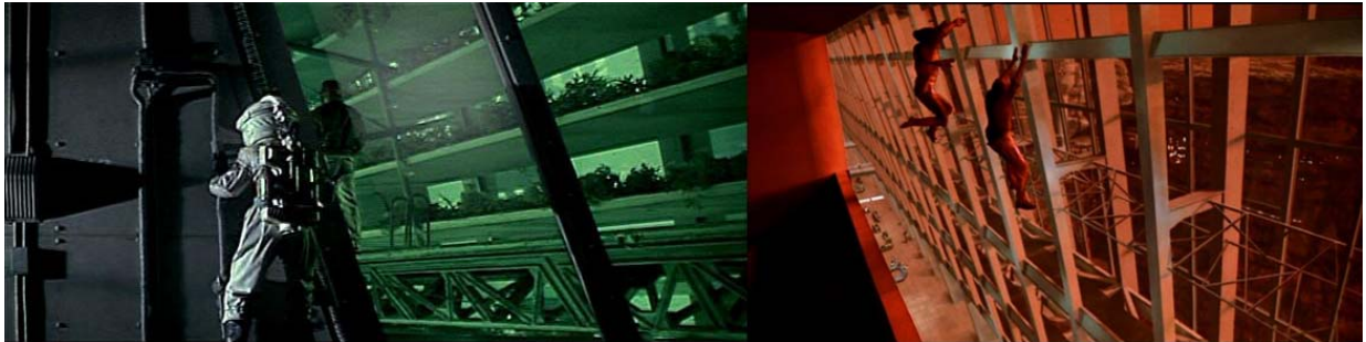
Fig. 4. Expansive glass skins: Outland (left), Total Recall (right) –the "interiorization" of the urban environment

glass or thin architectural skins in direct relationship to their non earth locations. "Silent Running" and "2001" also work the vulnerable aspect of skin into their plot lines and architecture. The giant geodesic domes in "Silent Running" play upon the tenuous position of man and his small piece of the environment as it floats in space.