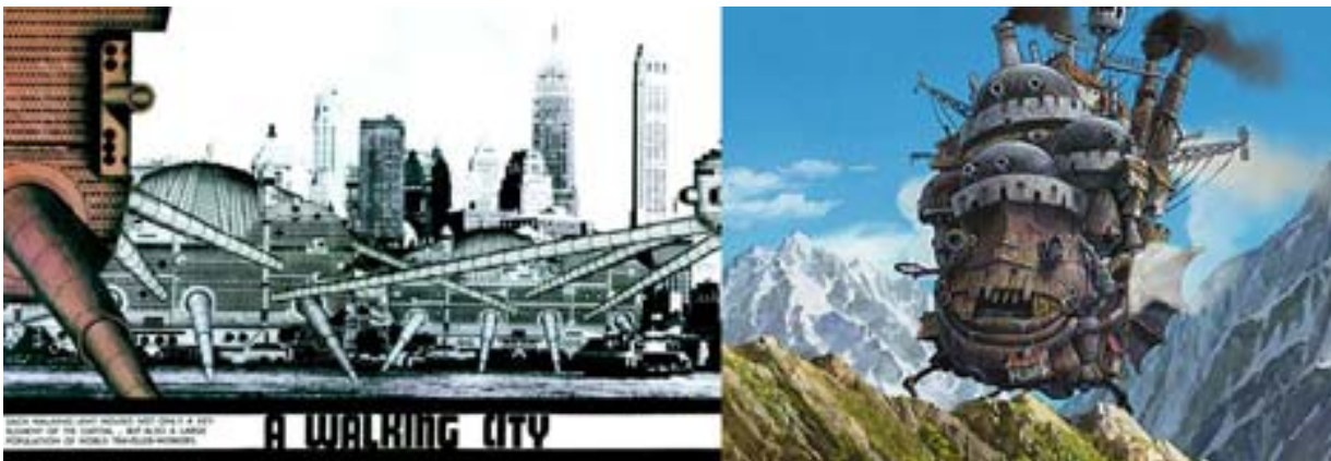
Fig. 1. Ron Herron’s Walking City versus Howl’s Moving Castle.

Whereas the extraordinary vision of architecture that drove the work of Boullée simply stretched the structural capacity and orientation of the traditional materials of the time, using traditional forms, the excited musings of Archigram and all during the 1960s proposed architectural alternatives that questioned everything , from the materiality and mechanical systems proposed, down to the static location of urban environments. Ron Herron’s “Walking City” remains quite unrealizable in “buildable” terms, but would not be beyond the capabilities of any CGI unit at Lucas Film or the animation team at Studio Ghibli, as recently shown in the 2005 film “Howl’s Moving Castle”, based upon the novel by Diana Wynn Jones. Howl’s Moving Castle brings a magical Walking House to life, in perhaps a more realistic, although animated style, than was represented by Herron’s renderings.