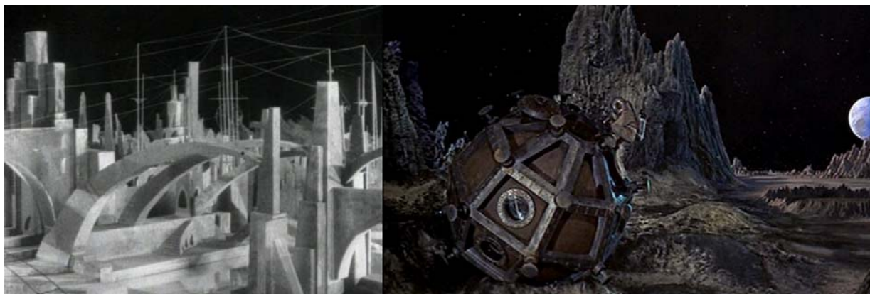
Fig. 2. Surface of Mars in Aelita (left), surface of the Moon in First Men (right)

"Just Imagine" (1930) was Fox Films combined farcical commentary on the propositions presented by "Metropolis" (1927) and "Aelita" (1924). Representations of early space travel in "Aelita", "Just Imagine" and "First Men in the Moon" are all consistently unrealistic – as were the approaches to the space environments.